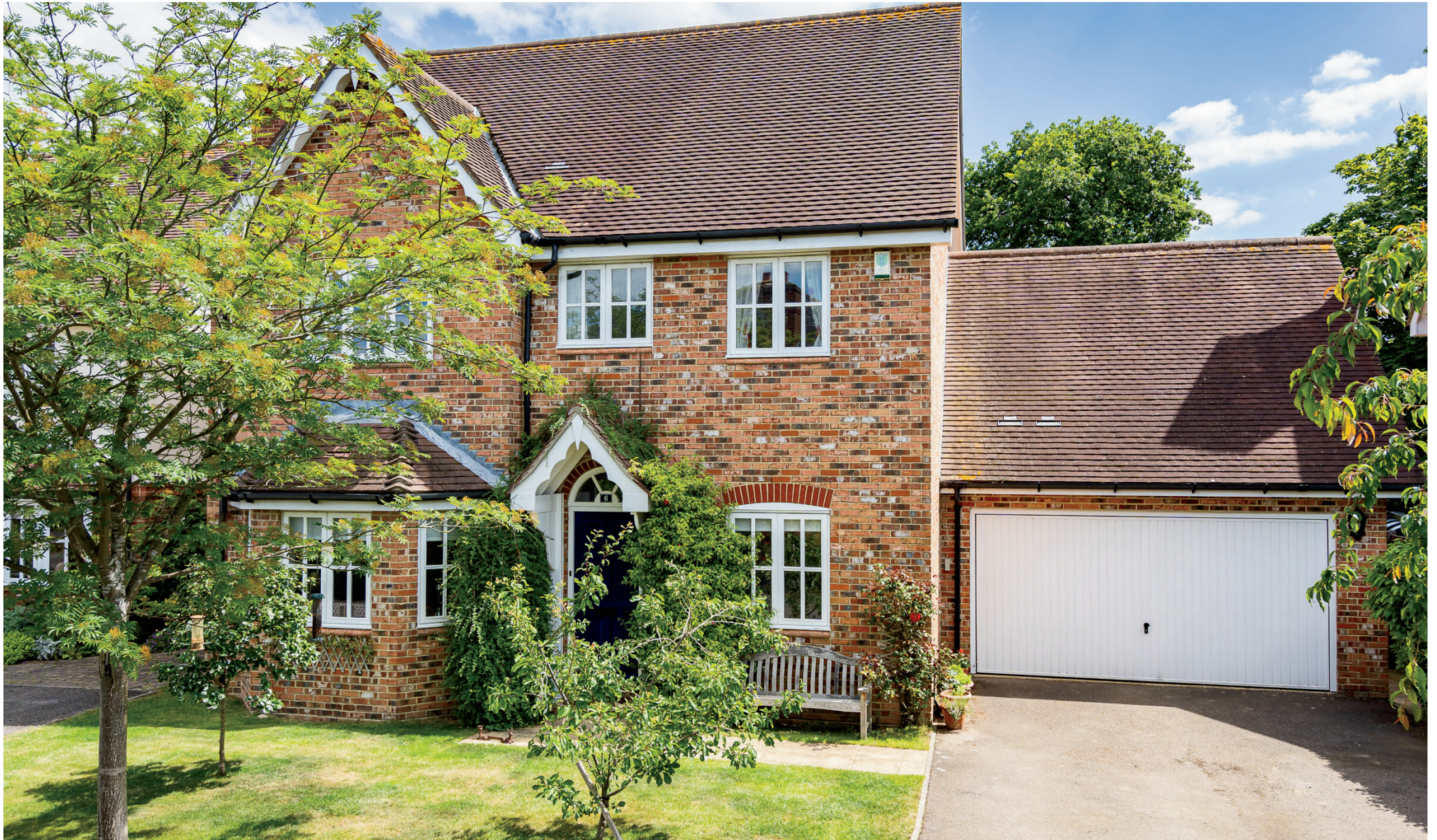
6 Old Vicarage Close High Easter | Chelmsford | Essex | CM1 4RW